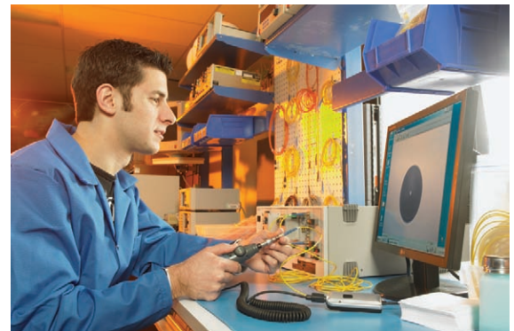
Patchcord inspection in a manufacturing environment