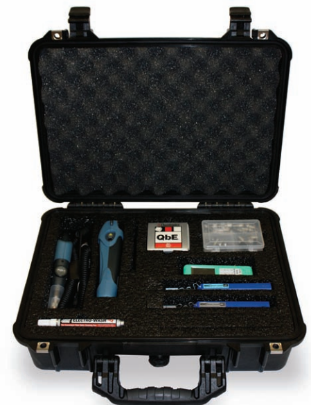
Deluxe cleaning kit