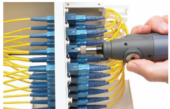
Patch panel bulkhead inspection